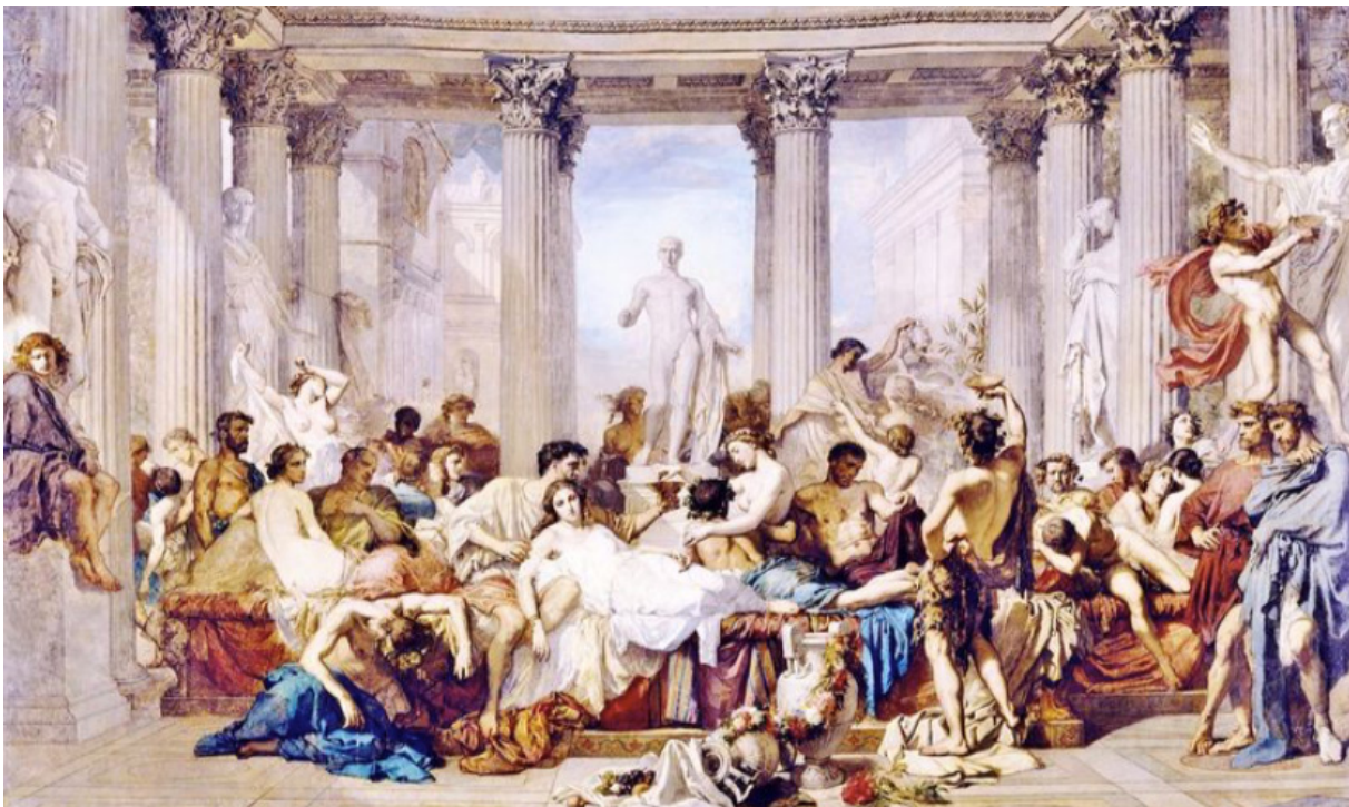
Thomas Couture, Romans of the Decadence – 1847

Depicting the Celebration of Saturnalia and “Dies Natalis Solis Invicti”