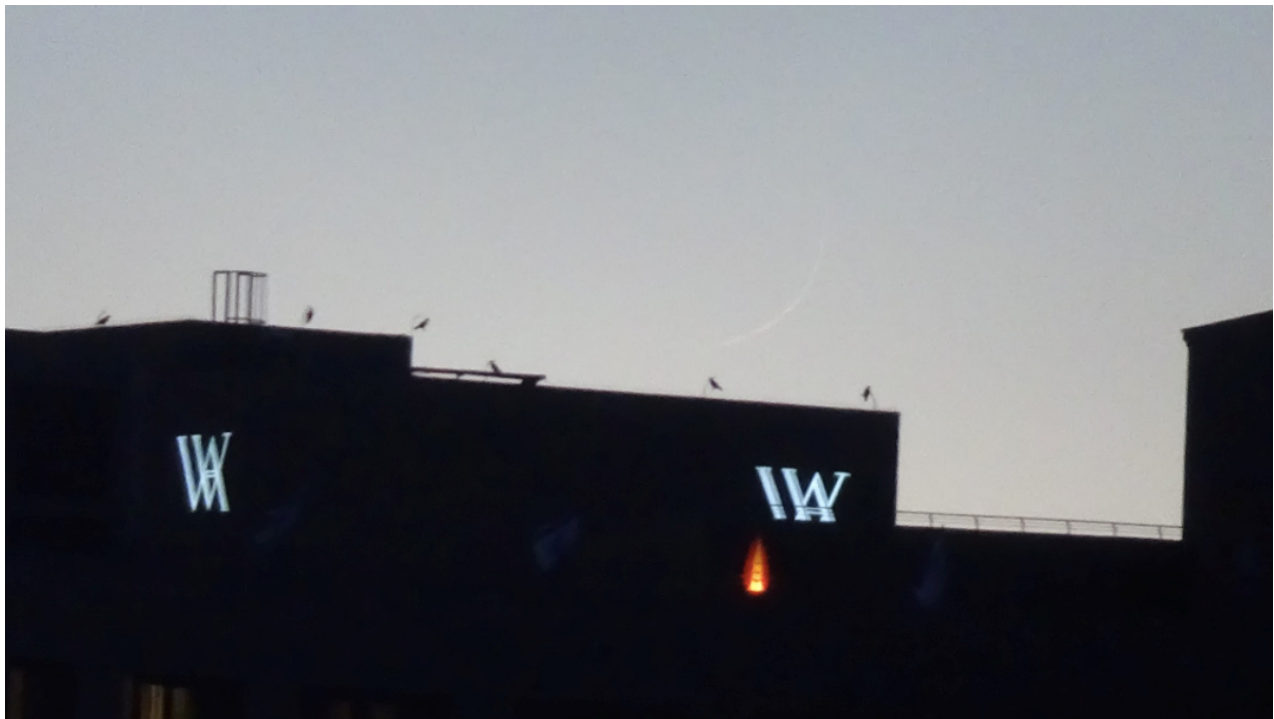
New Moon Spotted May 7, 2016 in Jerusalem, Israel