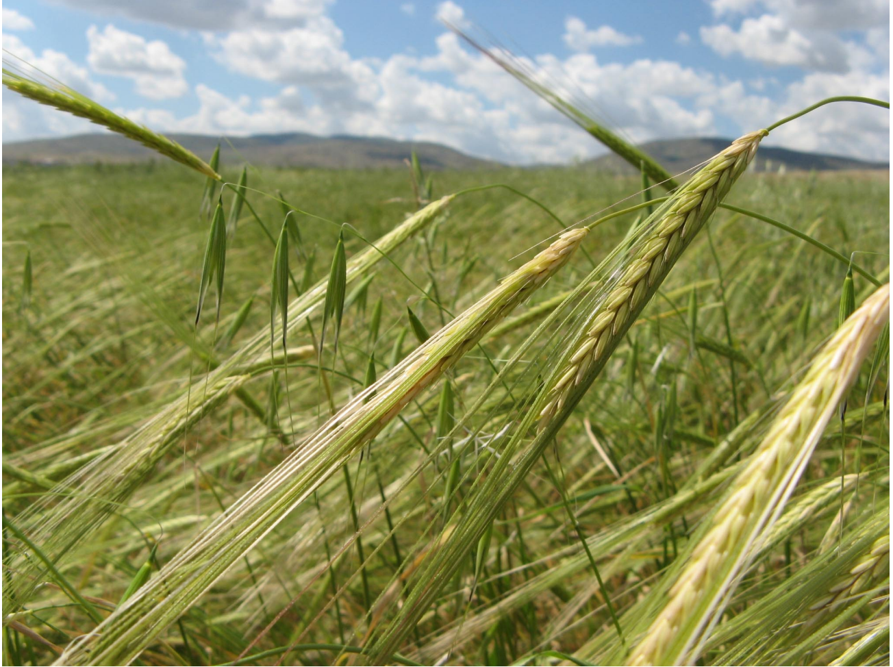
Barley seen in various stages of development in the Jordan Valley on March 22, 2011 C.E. The more developed heads were in Firm Dough to Hard Dough stage (86 and 87 on the Zadoks Scale).