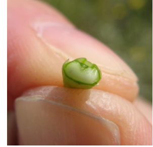
Soft Dough stage