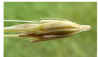
Hard dough barley was found which measured 87 on the Zadoks Scale