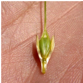
Firm Dough stage