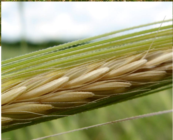
Large field of wild barley south of Beit Shean near the security checkpoint in the Jordan Valley, March 22, 2011 C.E.