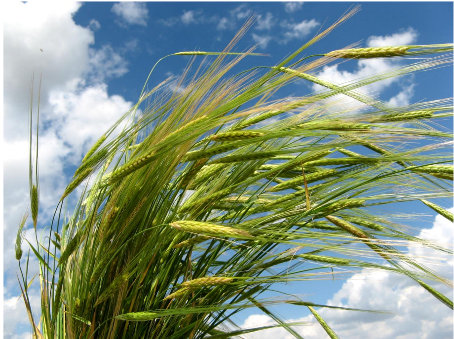
Firstfruits Aviv barley in the Jordan Valley on March 22, 2011 C.E.

These photographs were taken in the Jordan Valley on Day 16 of Month 1, 2011 C.E. Barley was seen ranging in development from Soft Dough to Hard Dough.