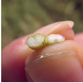
Firm Dough stage