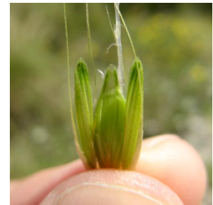
Soft Dough stage