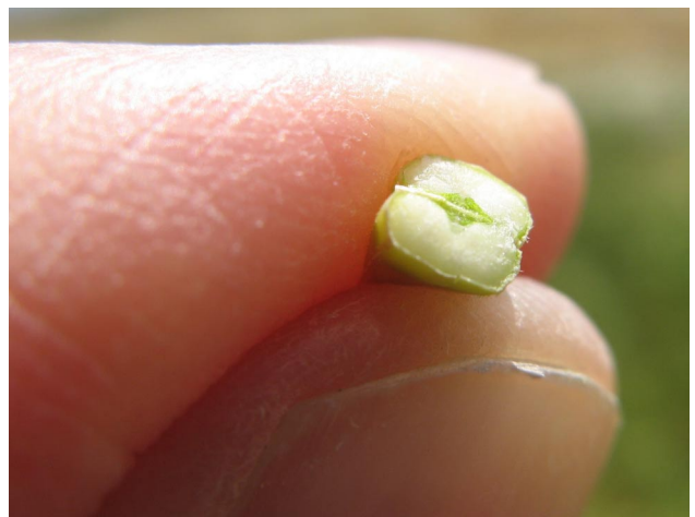
Aviv barley - well developed kernels found on March 22, 2011 C.E. in the Jordan Valley. These kernels have entered the Hard Dough stage or 87 on the Zadoks Scale of cereal grain development.