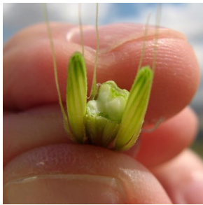
Firm Dough stage