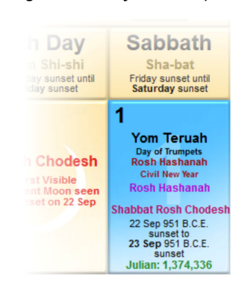
Figure 1: Priestly Course 1 (951 B.C.E.)

Solomon initiated the 24 Priestly Courses according to David's orders beginning with Course 1 – Jehoiarib on the weekly Sabbath on Yom Teruah on New Moon 7 in 951 B.C.E. [1 Tishri = Sabbath, September 23, 951 B.C.E. (1374336) = Day 1 / Month 7] It can be deduced that Solomon initiated the 24 Priestly Courses on a weekly Sabbath, a New Moon and a High Sabbath on the first day of Year 12 of his reign on Day 1 / Month 7 in 951 B.C.E.