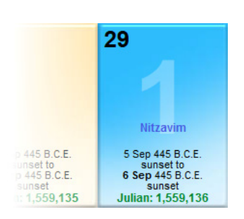
Figure 4: Priestly Course 1 (445 B.C.E.)

The Creation Calendar shows that Course 1 – Jehoiarib would have begun their shift on Sabbath on Day 29 / Month 6 in Year 20 of Artaxerxes I (465-424) in 445 B.C.E. [29 Elul = Sabbath, September 6, 445 B.C.E. (1559136) = Day 29 / Month 6]