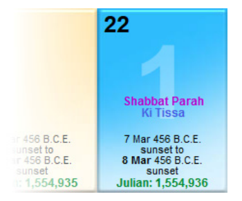
Figure 3: Priestly Course 1 (456 B.C.E.)

Course 1 – Jehoiarib Was on Duty at the Second Temple Dedication in 456 B.C.E.