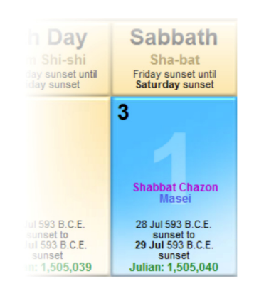
Figure 2: Priestly Course 1 (593 B.C.E.)

The account in Jeremiah 52:12-13 says the First Temple burned on Day 10 / Month 5. [10 Av = Sabbath, August 5, 593 B.C.E. (1505047) = Day 10 / Month 5]