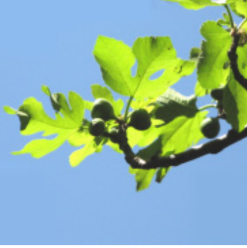
Figs in Jerusalem on April 2, 2008