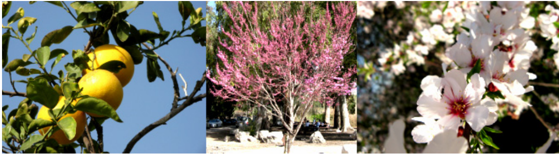
Fruit trees south of Ashkelon

By March 7, 2008 almond trees had been blooming for a month and many trees were in blossom throughout Israel.