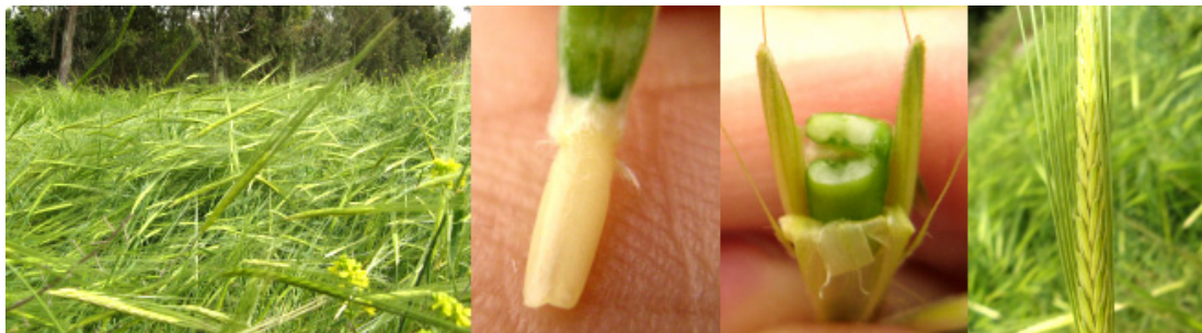
Zadok Soft Dough 85 Firm Dough 86 on Zadok Scale

Aviv barley between 85-86 on the Zadok scale in Tel Dan on March 25, 2008.