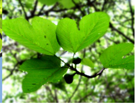
Figs seen at Tel Dan on March 25, 2008

Now Learn a parable of the fig tree: When the branch is yet tender and puts forth leaves, you know that summer is near .