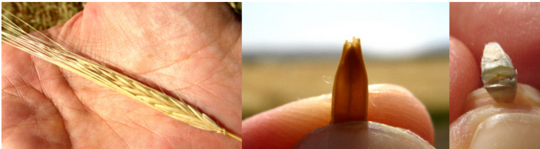
Kernel Hard 92 on the Zadok scale

Aviv barley between 87-92 on the Zadok scale in the Jordan Valley on March 24, 2008.