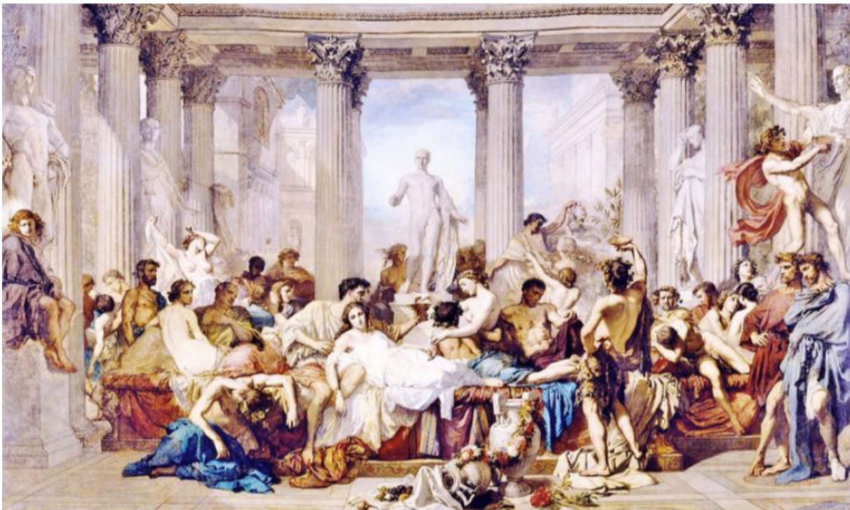
Thomas Couture, Romans of the Decadence – 1847 Depicting the Celebration of Saturnalia and “Dies Natalis Solis Invicti” By 354 C.E., the Birthday of the Pagan Deity Sol Invictus was being celebrated on December 25 Sol Invictus – the Unconquered Sun – was the official sun god of the late Roman Empire